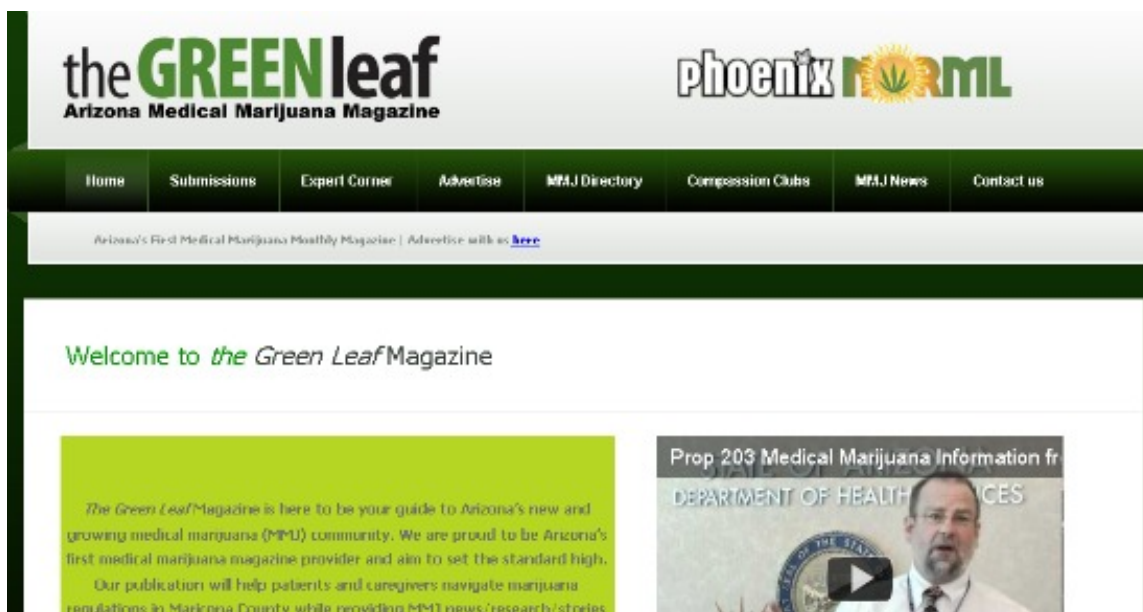
Screen capture of the website for The Green Leaf

Pollock says Haze Nation Magazine will also "broadcast and highlight music and visual artists in Arizona, to make it a bit more about entertainment." He expects initial circulation to be about 5,000 copies, and the magazine will be available at AM/PM locations, Bashas' grocery stores, Fresh & Easy stores, and of course, smoke shops.